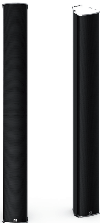
Illustration in colour option, see mechanical properties